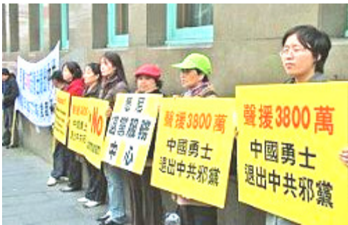
The Sydney rally supported the 38 million Chinese that have withdrawn from the CCP.