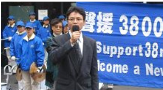
Former Chinese diplomat Chen Yonglin spoke at the rally

(Clearwisdom.net) The "Quit the CCP" Service Center of Sydney, Australia, organized a rally and a Great-Wall-of-Truth in Sydney's Chinatown on June 14, 2008. The events were to support the 38 million Chinese people that have withdrawn from the Chinese Communist Party (CCP) and its affiliated organizations. The rally also exposed and condemned the CCP for directing its overseas Chinese organizations to hire thugs to surround the Quit the CCP Service Center in Flushing, New York, and attack volunteer workers and Falun Gong practitioners at the service center.